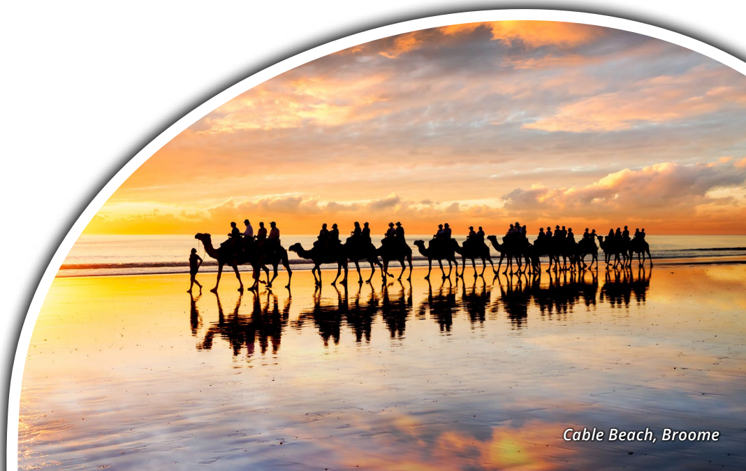
Cable Beach, Broome